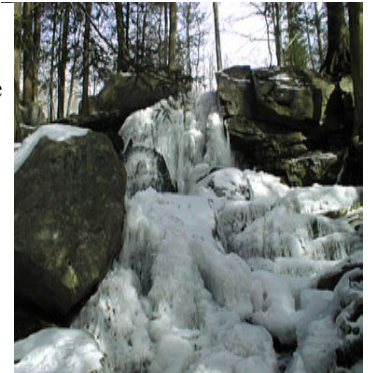
Waterfall at Spruce Lake in winter

To make reservations and for detailed information, please contact: Steve Strunk at AMEC, PO Box 267, Milford Square PA 18935.