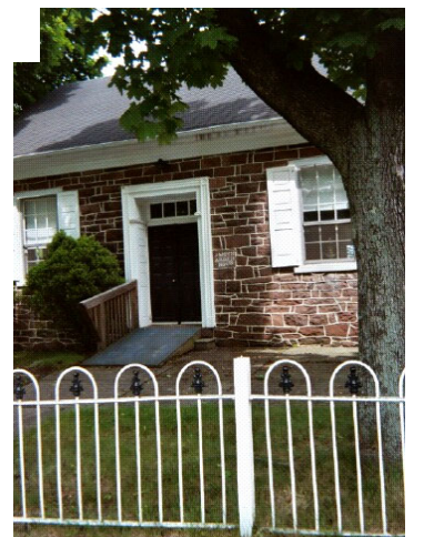
Springfield Mennonite Church